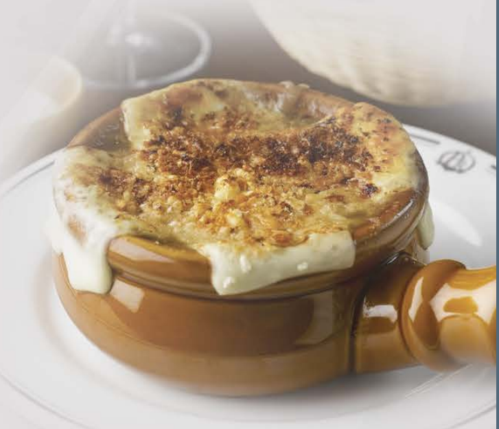
FRENCH ONION SOUP